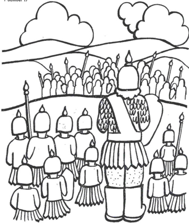
King Saul fought against the Israelite enemies. One giant of a man challenged Saul's army. His name was Goliath.