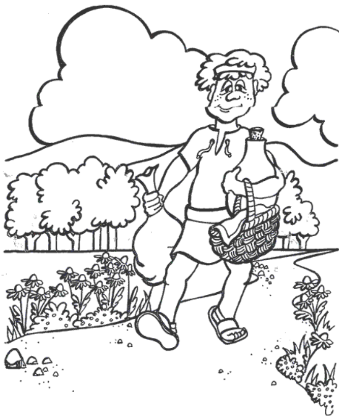
No one wanted to fight Goliath, because he was too strong. One day, David came to bring food for his brothers in the army.