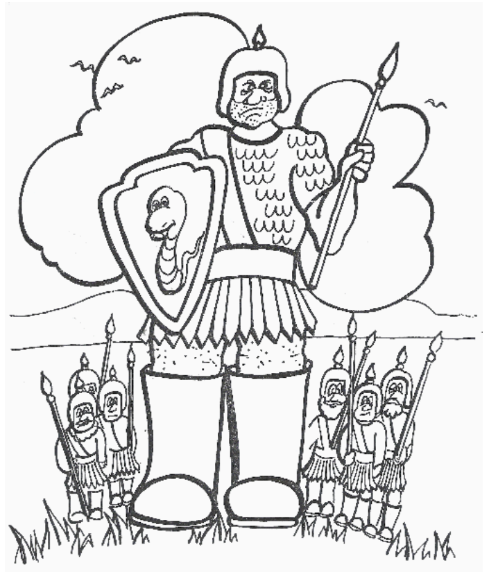
Goliath was over nine feet tall. He shouted, "If your man can beat me, we will be your servants. If I beat you, you will be our servants."